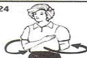
Change of Courts