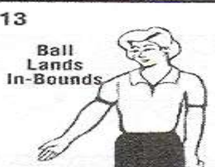
Ball Lands In-Bounds