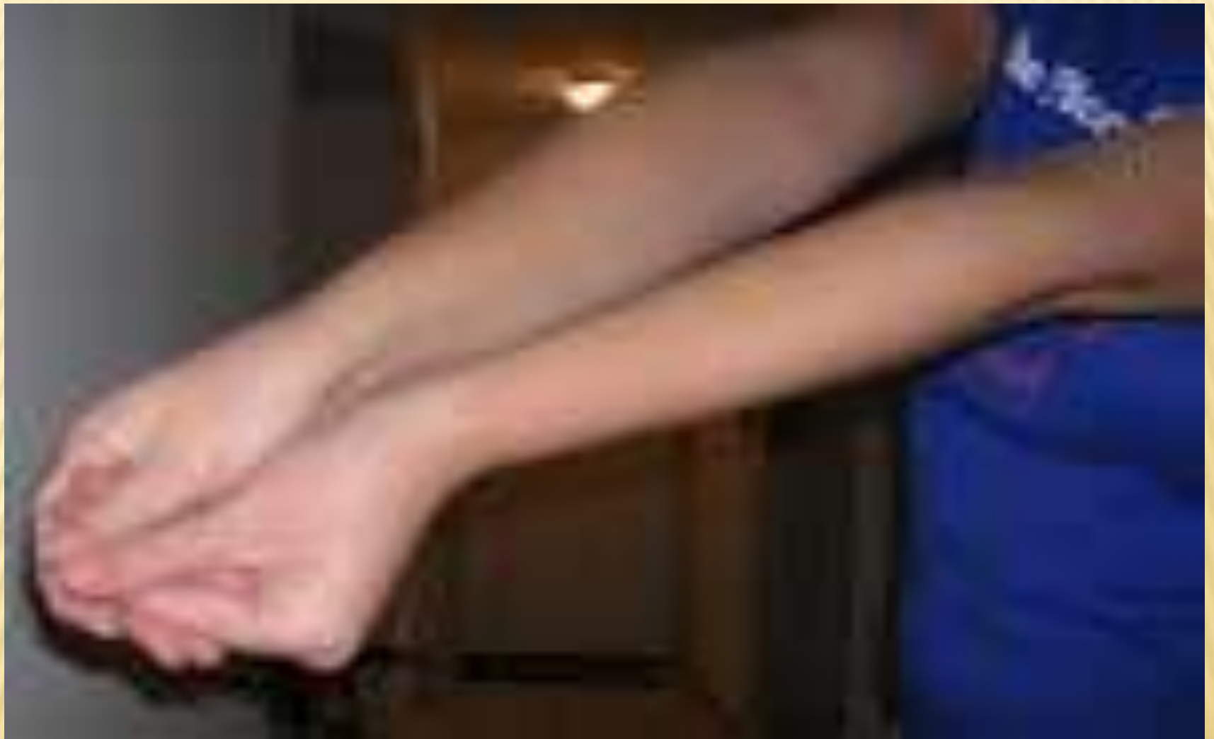
The Cup Method.