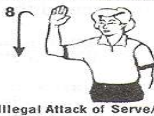
Illegal Attack of Serve/ Back Row Attack