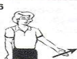
Authorization to Enter