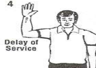
Delay of Service