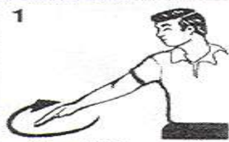
Illegal Alignment/ Improper Server