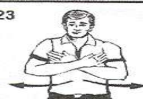
End of Game