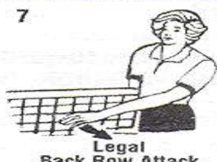
Legal Back Row Attack