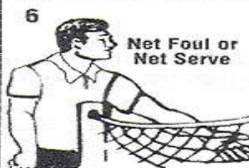
Net Foul or Net Serve